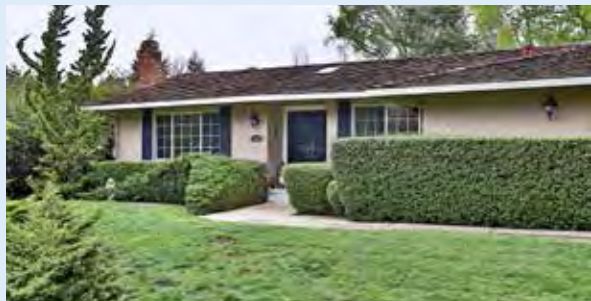
3832 Via Granada, Moraga Sold with multiple offers -- $1,438,000 4 bedroom with large, level yard and pool in the Campolindo neighborhood.