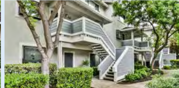
2588 Oak #239, Walnut Creek Sold over asking with 10-day close -- $500,000 2 bedroom, 2.5 bath condo with WC schools and close to BART.