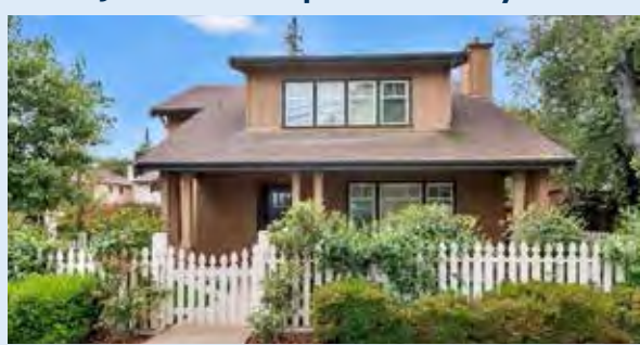
$835,000 18 Amanda Lane, Lafayette $1,425,000 ark and Charming downtown living. 10-year-old home. Walk to shops, restaurants and more.

Spring inventory is blooming. Call us today so we can help you find the perfect place to call home.