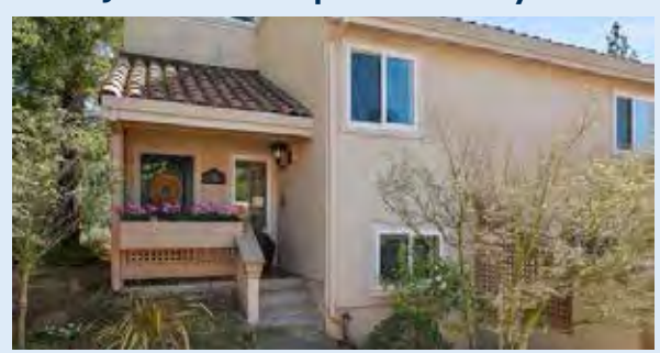
238 Paseo Bernal, Moraga $835,0 3 bedroom, 2.5 bath townhome close to park and shopping.